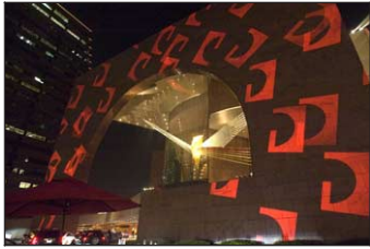
ANA VENEGAS, THE REGISTER

It was a sea of suits as 450 guests packed the patio of the Balboa Bay Club & Resort for a macho 90 minutes of Scotch tasting, a martini bar and cigar station.